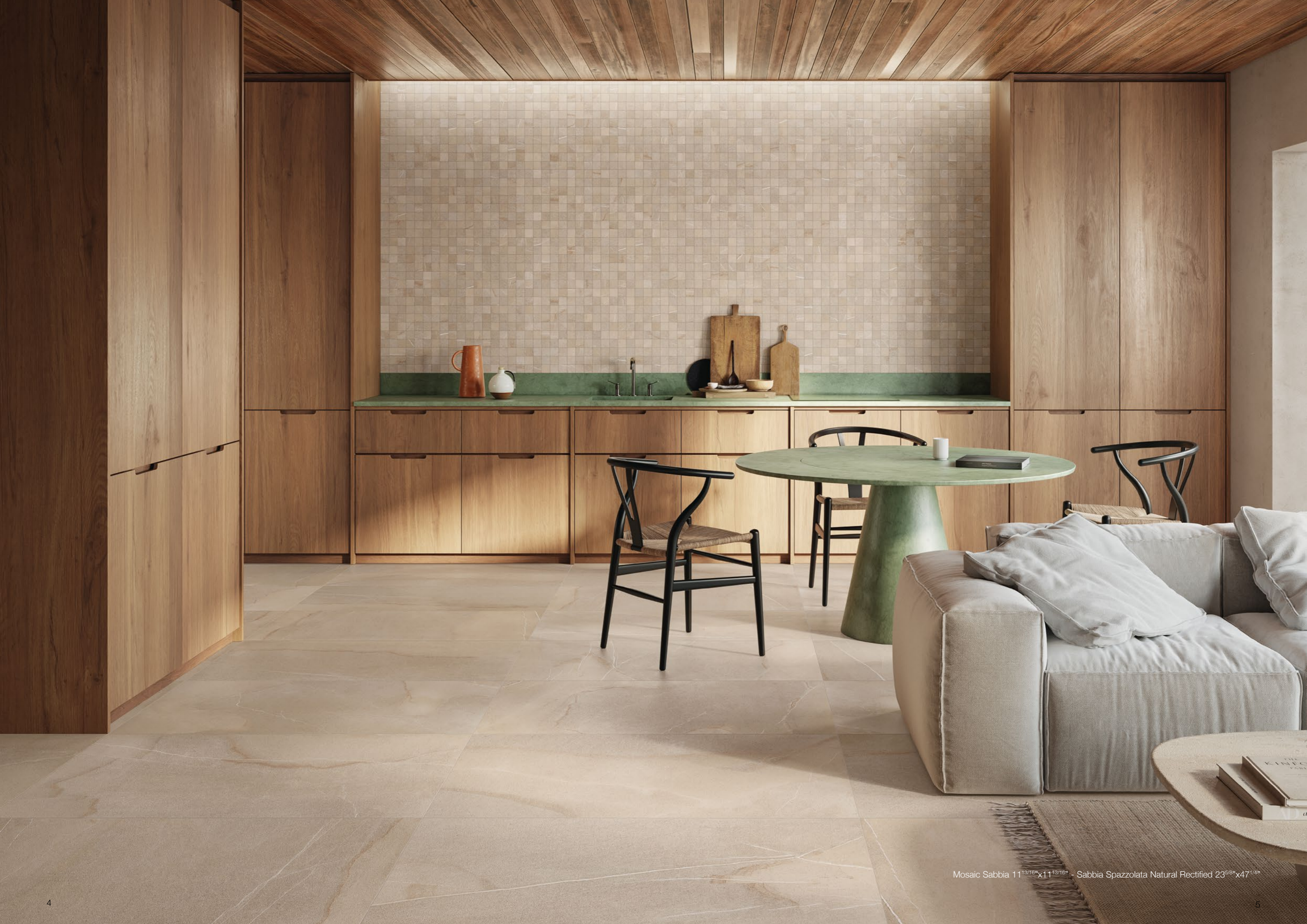
Mosaic Sabbia 11 13/16" x11 13/16" - Sabbia Spazzolata Natural Rectified 23 5/8" x47 1/4"